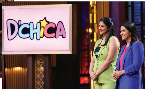
Pearl alumni in Shark Tank India